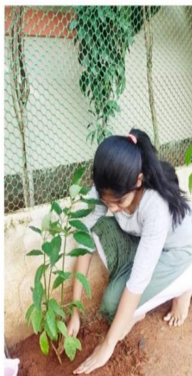
Divya 4G6 ECE-D

As per the instructions of Telangana government, the Environmental club conducted Haritha Haram program for students on 15-08-2020. Students planned to plant different sapling in their homes due to the pandemic. Around 59 students actively participated in plantation.